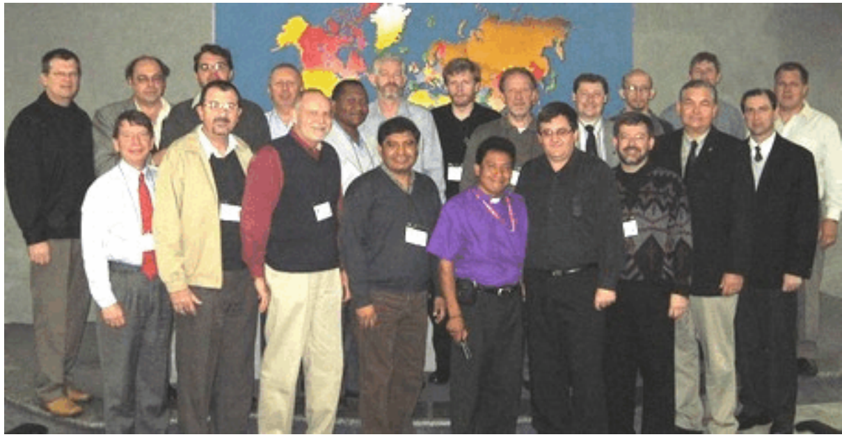
Participants of the Latin American Regional ILC Conference.